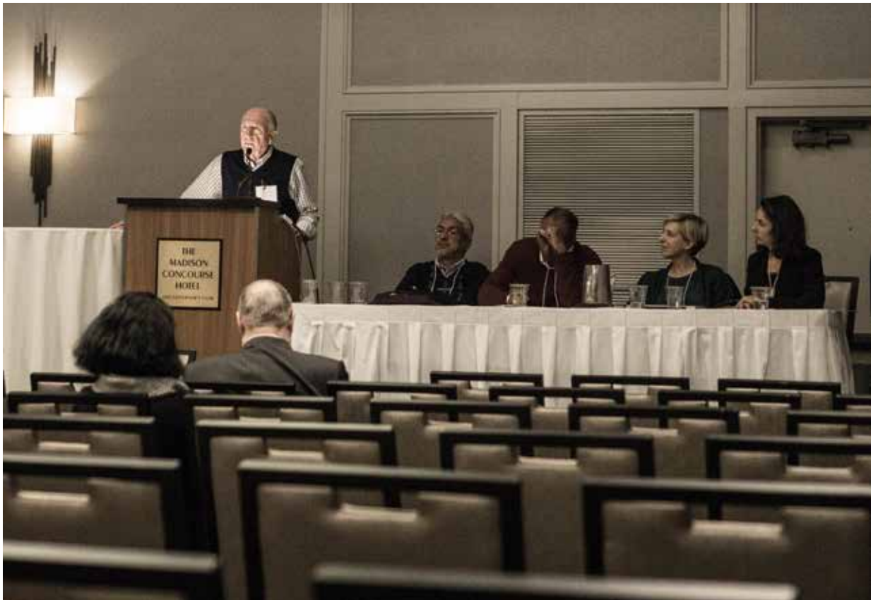
Panel at the annual South Asian Conference in Madison

Throughout 2018 SASNET has hosted three workshops and helped with the organization of one conference. These events discussed contemporary issues in South Asia and Sweden.