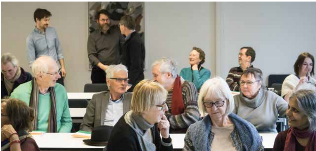
Crowd at a SASNET event