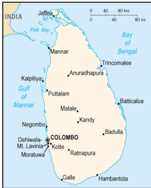
Figure 1: Map over Sri Lanka 101

This chapter is a short introduction the history of Sri Lanka. The focus is on Muslim history and some political movements that are relevant in the years of 1989-1992, but I will start with some important political events throughout the history of Sri Lanka. In the following chapters many cities will be mentioned so I will include a map in this part: